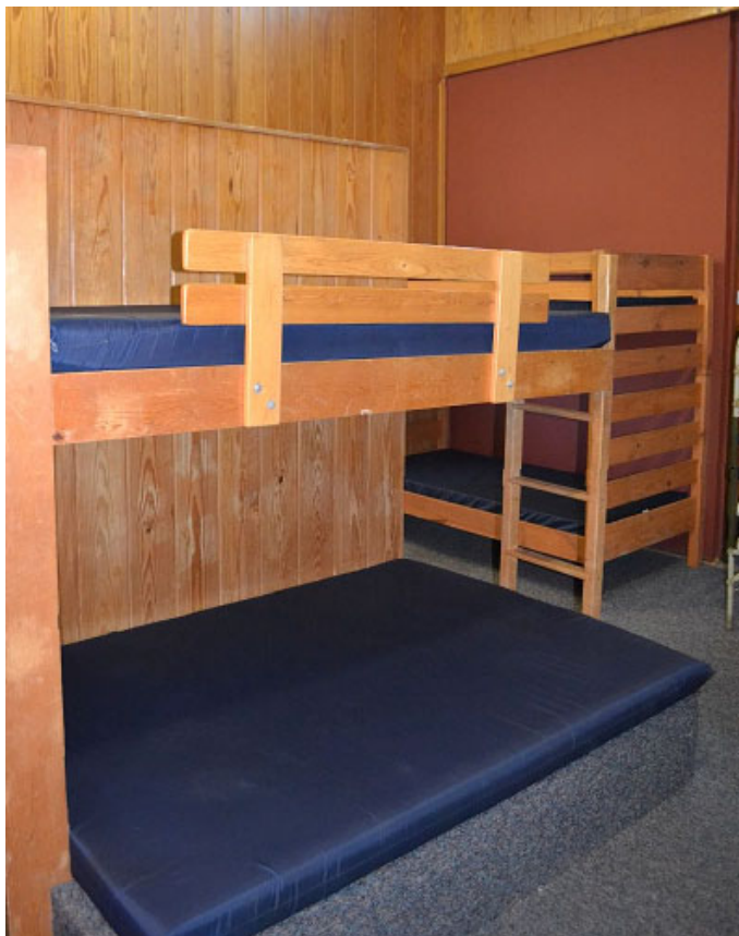
Current built in wooden beds